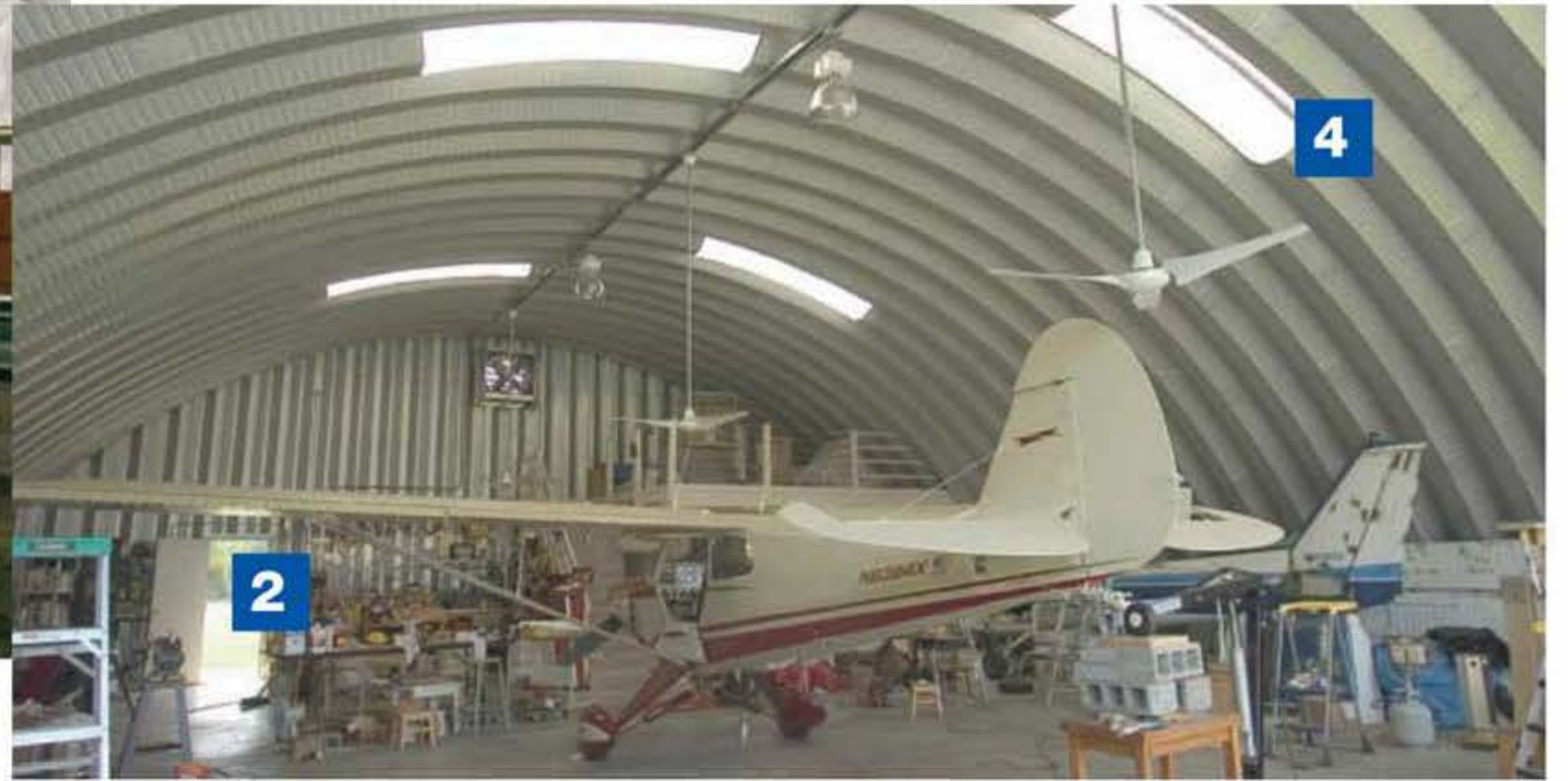
1 Overhead Door